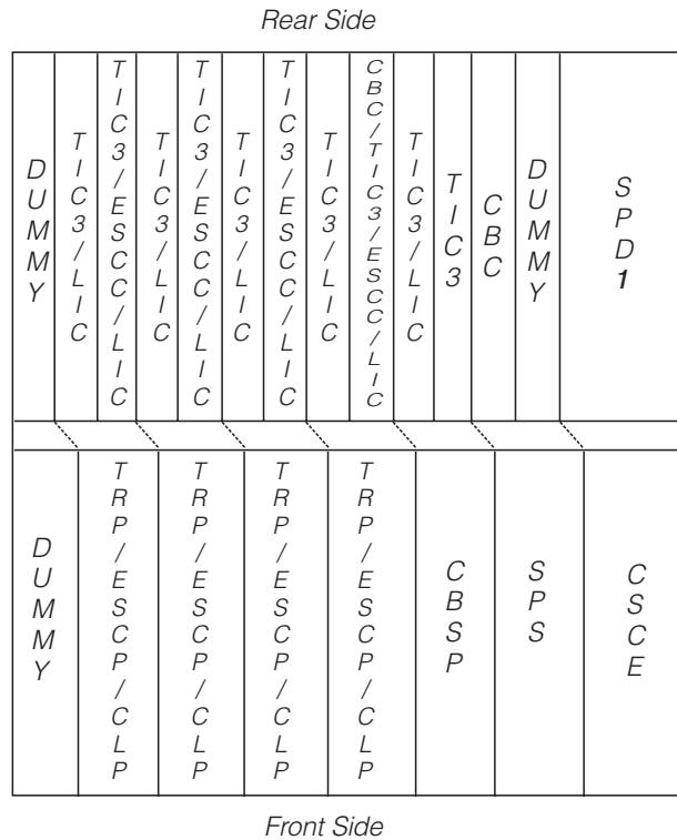
Figure 1. Basic Enclosure